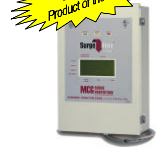
SF400M - Super Class Entry Protector